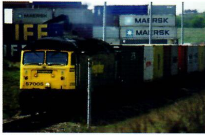
SW Cambridgeshire in 2025?

There is a risk of permanent disruption to the lives of South West Cambridgeshire residents due to the planned rail link, literally driving a wedge between our local communities.